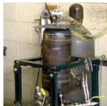
Equipment used for cylinder testing (left), and PRV testing (right)