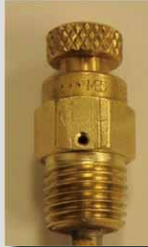
An alternative means of measuring the filling process could help reduce emissions.

To evaluate the performance of these low-emission gauges, the propane industry conducted a study to assess the extent of decreased propane flow from FMLLGs with reduced orifice diameters. The study determined that these gauges pose no greater risk of clogging or freezing than FMLLGs with standard orifice sizes.