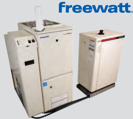
Installation of either a warm-air or hydronic Freewatt Plus unit may qualify a residence owner for an energy efficiency tax credit.

CHP systems provide heat and generate electricity with higher efficiency and lower emissions levels than conventional heating and power generation alternatives. The quiet, compact Freewatt Plus micro-CHP system, available in warm-air and hydronic versions, brings the benefits of propane-fueled CHP to homes and small businesses.